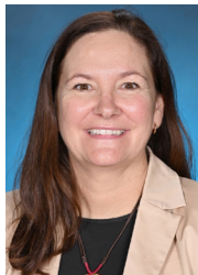
Mrs Kirren Wilson Library